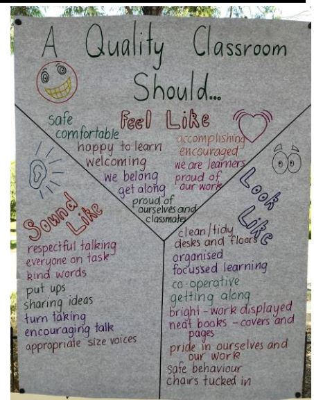
Year 5 Y-Chart about what a quality classroom should be like.