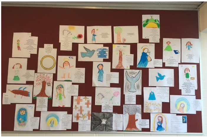
Year 5 wrote their own version of the Hail Mary and then responded through art...