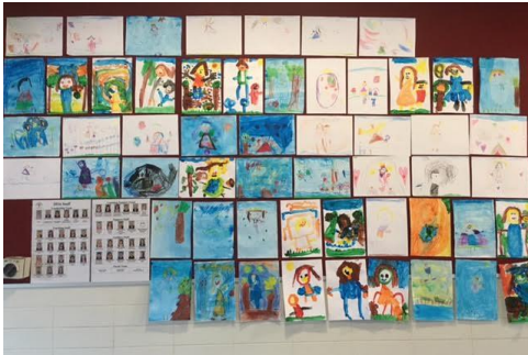
Kindergarten painted or drew a picture of Mary...

On Tuesday May 24 we celebrated the Feast of Mary Help of Christians, our feast day. We began our day by gathering for a liturgy to celebrate Mary, our country and school's patron. The students then spent time with their teachers reflecting on the person of Mary and were invited to make a creative response to answer the question "Who is Mary to Me?"