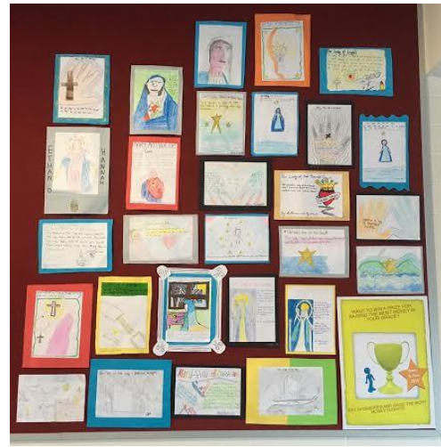
Year 6 researched and responded to the many names Mary is called...