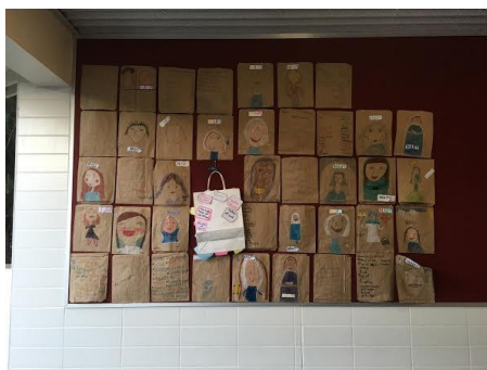
Year 3 created a 'Character Grab Bag' using many words to describe the qualities of Mary...