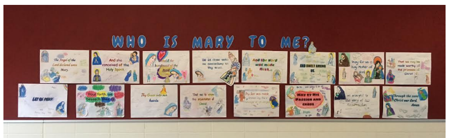
Year 4 deconstructed the Angelus and the Hail Mary and wrote about meaning of the prayers to them...