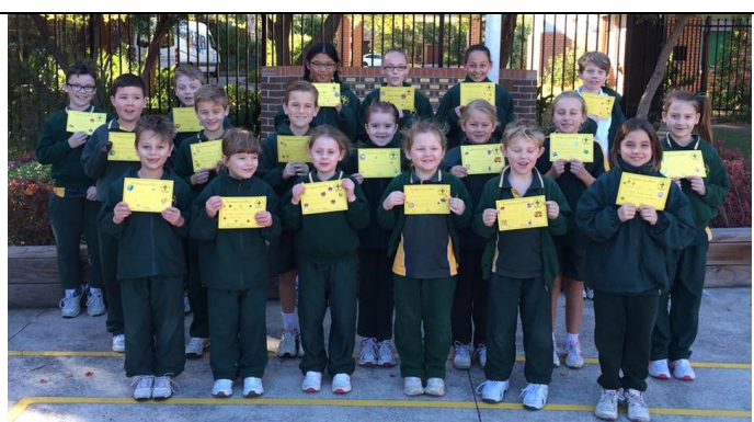
TERM 2 WEEK 5